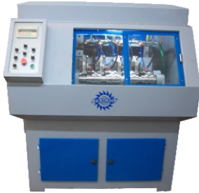
Four Station Honing Machine for Spherical and Ball Outer Bearing Races