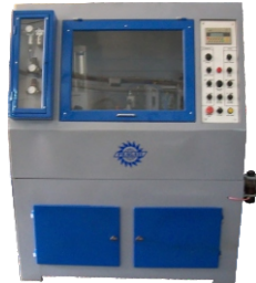
Double Head Honing Machine for Double Groove Ball Bearing Races