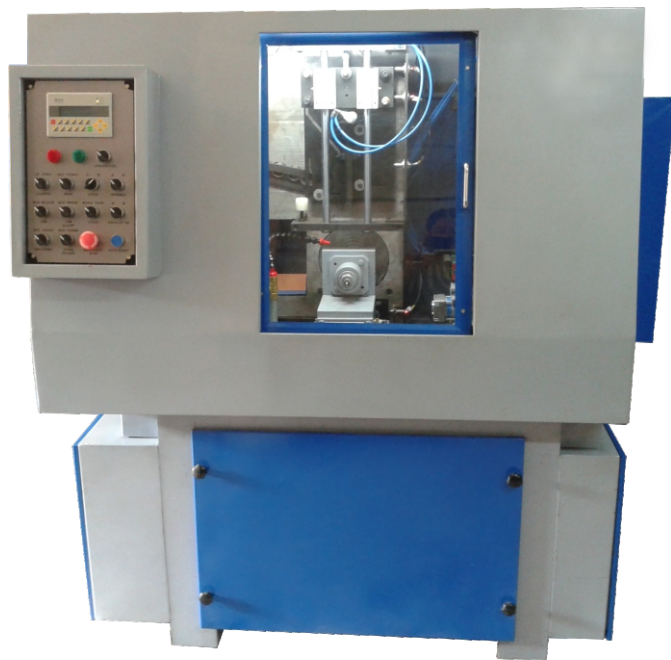
Auto Loading - Unloading

Pragati Horizontal Honing Machine for Taper & Cylindrical Bearing Races of Outer and Inner Bearing Races with AutoLoading.